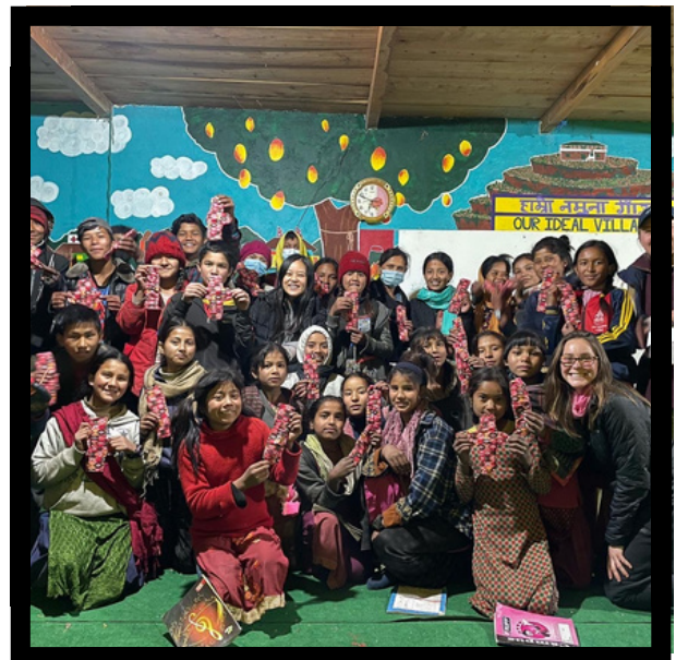
Students proudly showing their homemade pads made in youth group