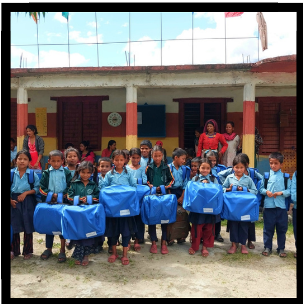
30 First-grade students were provided backpacks that turn into desks through our collaboration with Educase